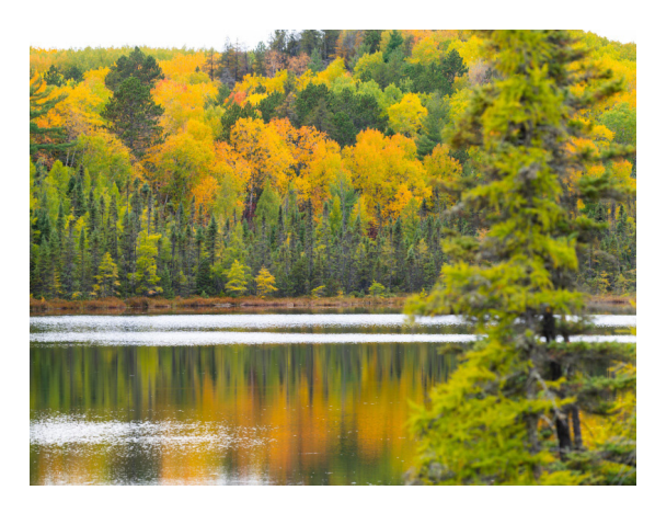
Minnesota's Heritage Forest

BargerTech's BEST Plan, a revolutionary waste-to-renewable energy, biofuels, and natural fertilizers project designed to protect precious land, air, and water resources.