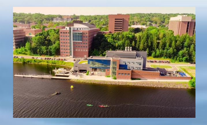
Experienced Professional Support Staff

State of the Art Research Facility and Work Space