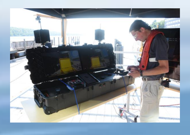
Advanced Sonar Systems